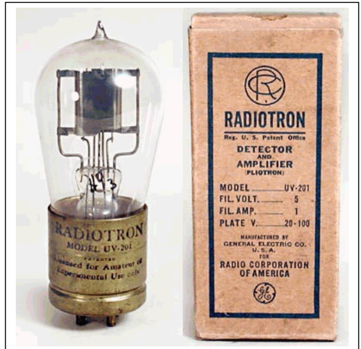
General Electric - RCA UV-201 Detector & Amplifier Triode ca. 1920.